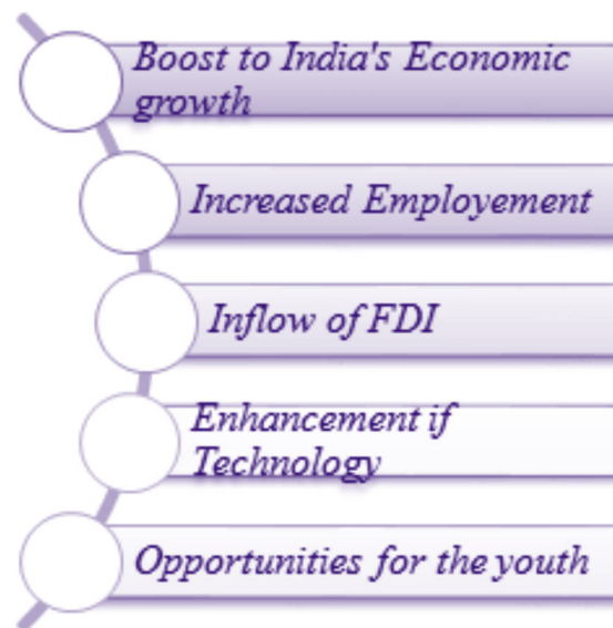
Figure 3 Benefits of Make in India